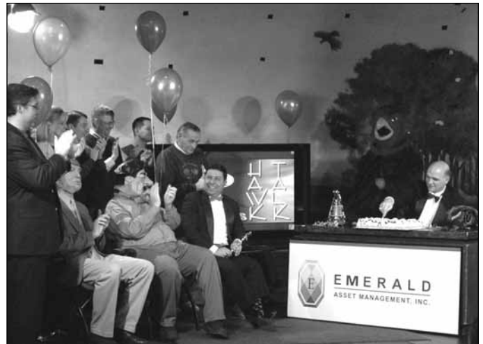
Martelli brought out the tuxedos, balloons and cake for the 10th anniversary show in January of 2006. The episode featured a parade of guests from the past 10 years.