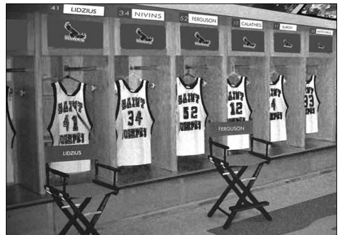
Included in the plan are new locker rooms for the men's and women's basketball teams, as well as new coaches' offices.