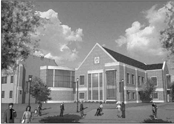
Artist's renderings of the campus view of the new men's and women's basketball center, with construction expected to begin in Spring 2007.

An expansion of Alumni Memorial Fieldhouse and a dedicated center for men's and women's basketball highlight a comprehensive plan for enhancing varsity and recreational athletics at Saint Joseph's University. The total project will proceed in three phases over the next several years: